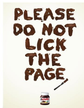
Sample Print Advert